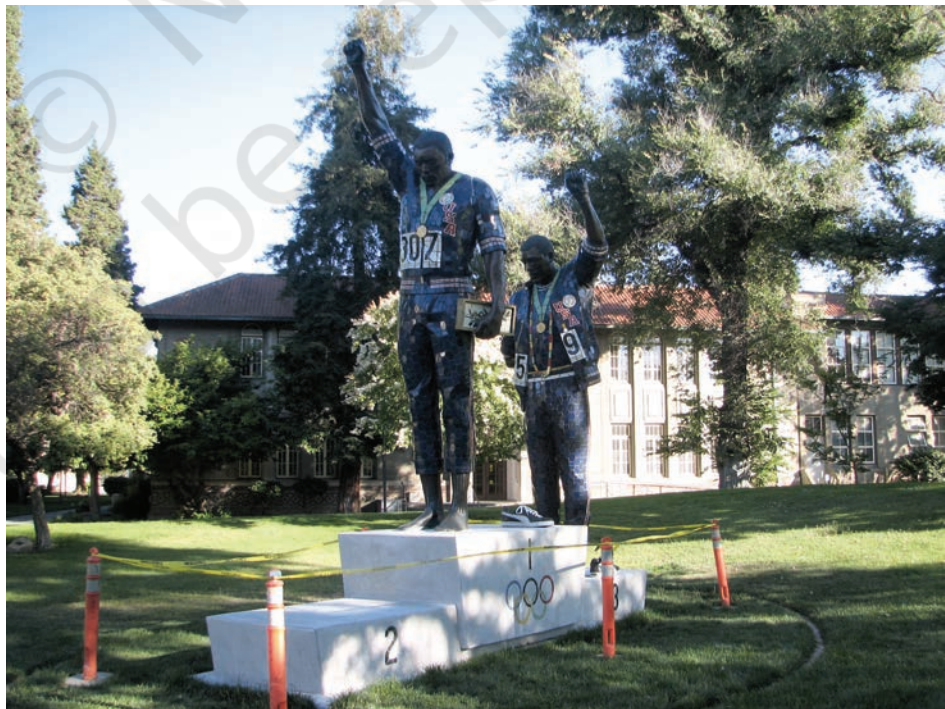
In 2005, the San Jose State University installed a 20-foot high sculpture representing the protest by Tommie Smith and John Carlos. A photograph of the original medal ceremony in 1968 is on the top.

Do you think that Carlos and Smith should have raised an internal matter of American society in an international forum? Would you say that what they did was political? Why do you think Peter Norman, who was neither Black nor American, joined in the gesture of protest? If you were in Norman's place what would you do?