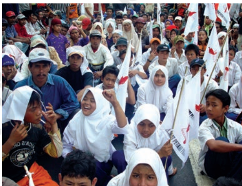
Land rights protest: farmers of West Java, Indonesia. In June 2004, about 15,000 landless farmers from West Java, travelled to Jakarta, the capital city. They came with their families to demand land reform, to insist on the return of their farms. Demonstrators chanted, "No land, No vote" declaring that they would boycott Indonesia's first direct presidential election if no candidate backed land reform.