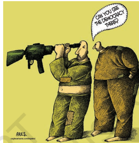
Seeing the democracy