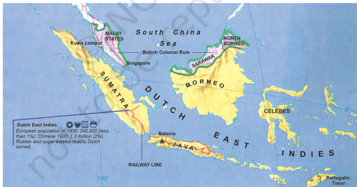
Fig.22 – Most of Indonesia's forests are located in islands like Sumatra, Kalimantan and West Irian. However, Java is where the Dutch began their 'scientific forestry'. The island, which is now famous for rice production, was once richly covered with teak.

Dirk van Hogendorp, cited in Peluso, Rich Forests, Poor People , 1992.