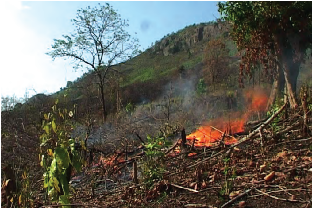
Fig. 16 – Burning the forest penda or podu plot.

In shifting cultivation, a clearing is made in the forest, usually on the slopes of hills. After the trees have been cut, they are burnt to provide ashes. The seeds are then scattered in the area, and left to be irrigated by the rain.