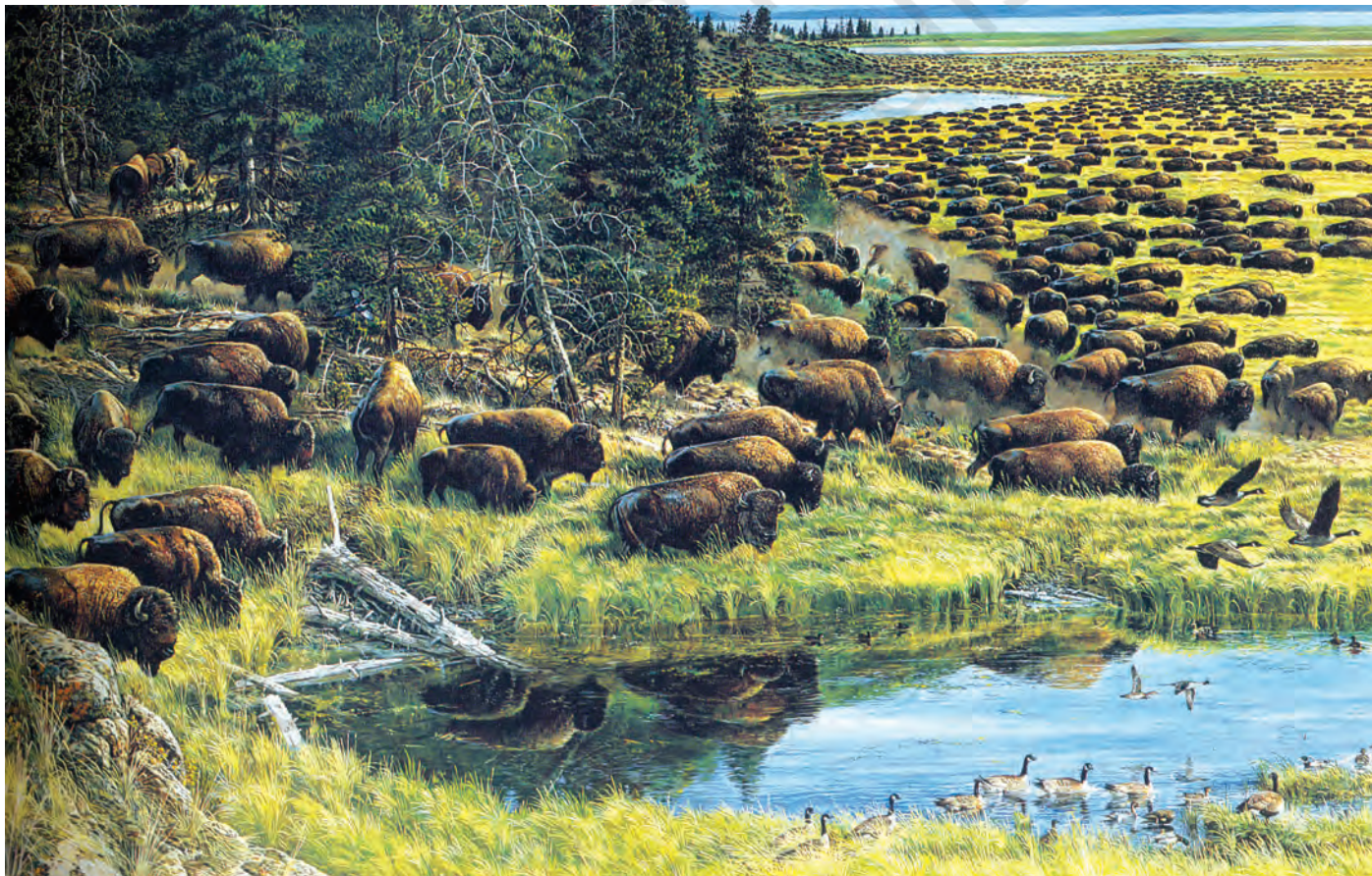
Fig.2 – When the valleys were full. Painting by John Dawson.

In 1600, approximately one-sixth of India's landmass was under cultivation. Now that figure has gone up to about half. As population increased over the centuries and the demand for food went up, peasants extended the boundaries of cultivation, clearing forests and breaking new land. In the colonial period, cultivation expanded rapidly for a variety of reasons. First, the British directly encouraged