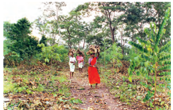
Fig.6 - Women returning home after collecting fuelwood.