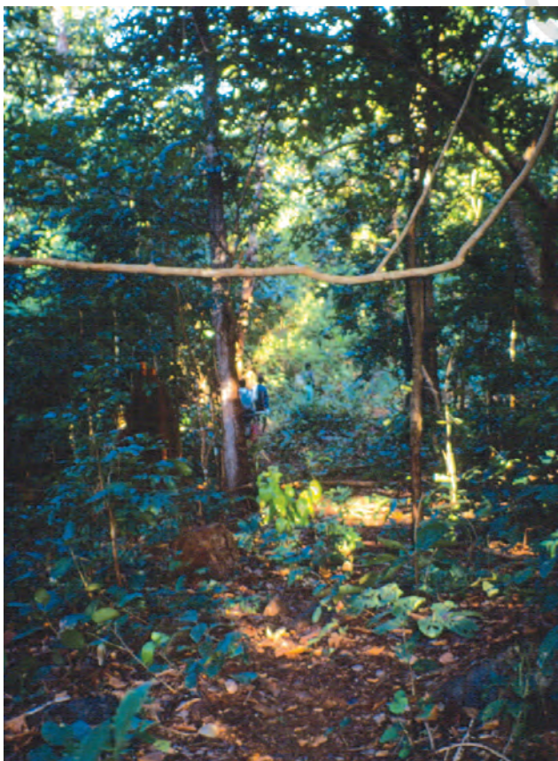
Fig. 1 – A sal forest in Chhattisgarh.

A lot of this diversity is fast disappearing. Between 1700 and 1995, the period of industrialisation, 13.9 million sq km of forest or 9.3 per cent of the world's total area was cleared for industrial uses, cultivation, pastures and fuelwood.