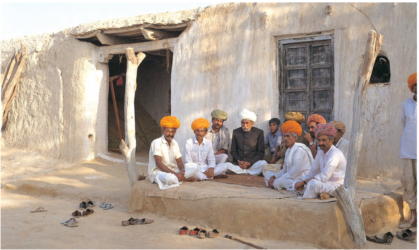
Fig.9 – A Maru Raika genealogist with a group of Raikas.

The genealogist recounts the history of the community. Such oral traditions give pastoral groups their own sense of identity. These oral traditions can tell us about how a group looks at its own past.