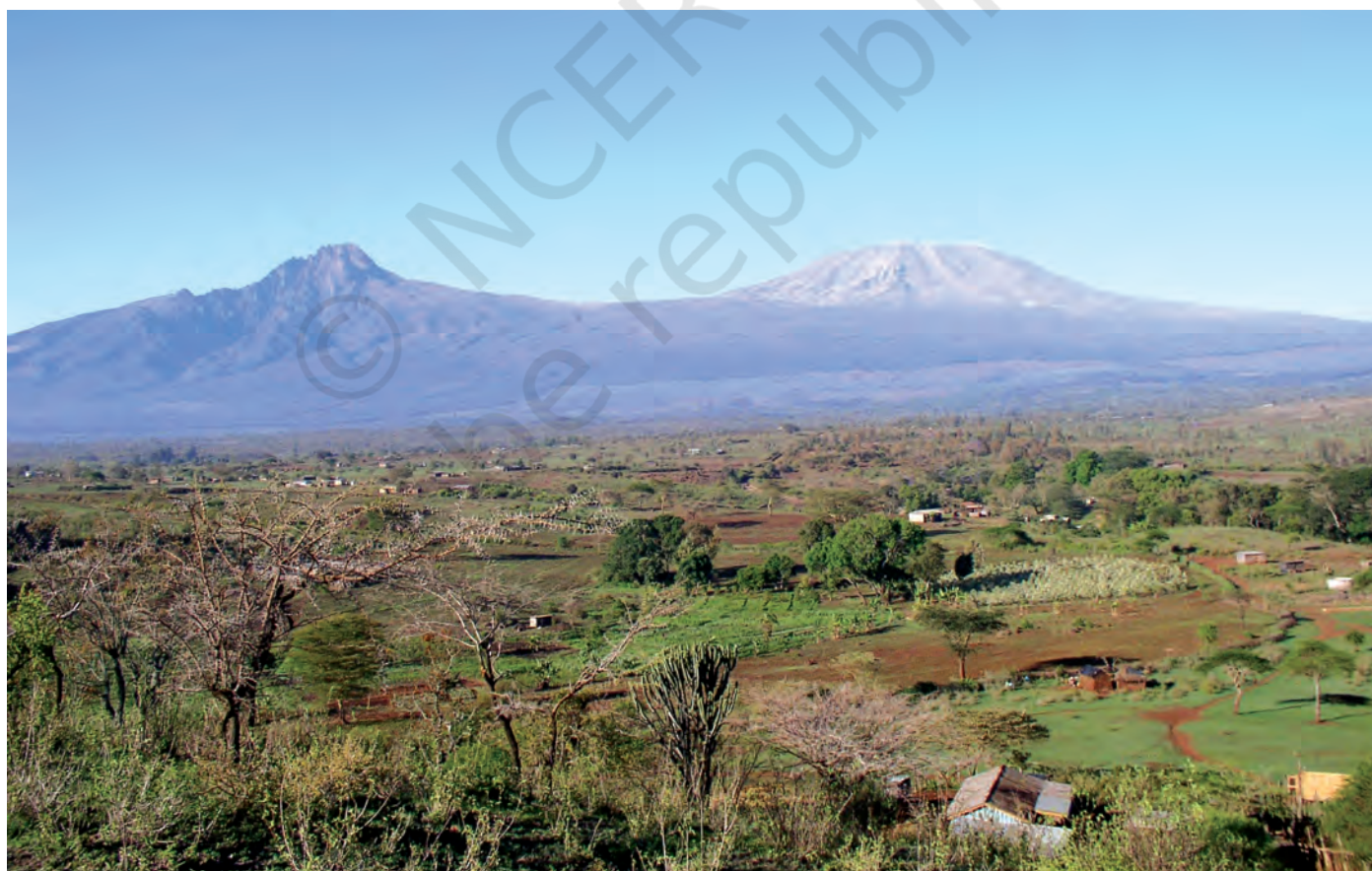
Fig. 12 – A view of Maasai land with Kilimanjaro in the background.

Like pastoralists in India, the lives of African pastoralists have changed dramatically over the colonial and post-colonial periods. What have these changes been?