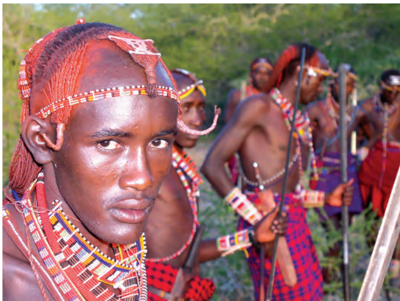
Fig. 17 - Even today, young men go through an elaborate ritual before they become warriors, although actually it is no longer common. They must travel throughout the section's region for about four months, ending with an event where they run to the homestead and enter with an attitude of a raider. During the ceremony, boys dress in loose clothing and dance non-stop throughout the day. This ceremony is the transition into a new age. Girls are not required to go through such a ritual.

To administer the affairs of the Maasai, the British introduced a series of measures that had important implications. They appointed chiefs of different sub-groups of Maasai, who were made responsible for the affairs of the tribe. The British imposed various restrictions on raiding and warfare. Consequently, the traditional authority of both elders and warriors was adversely affected.