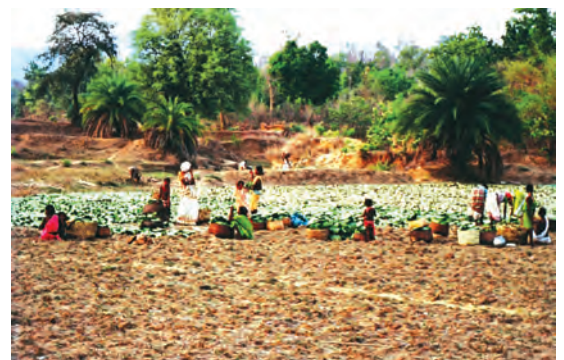
Fig. 13 – Drying tendu leaves.

The Forest Act meant severe hardship for villagers across the country. After the Act, all their everyday practices – cutting wood for their