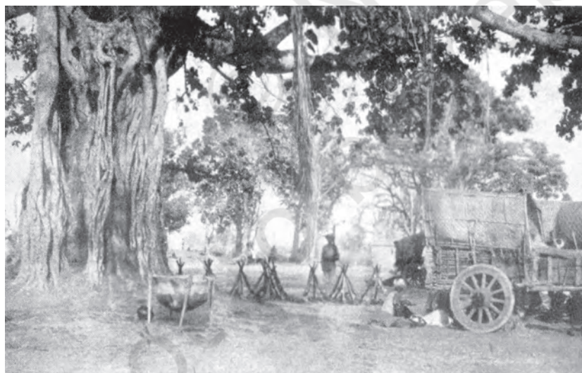
Fig.19 – Army camp in Bastar, 1910.

Bastar is located in the southernmost part of Chhattisgarh and borders Andhra Pradesh, Orissa and Maharashtra. The central part of Bastar is on a plateau. To the north of this plateau is the Chhattisgarh plain and to its south is the Godavari plain. The river Indrawati winds across Bastar east to west. A number of different communities live in Bastar such as Maria and Muria Gonds, Dhurwas, Bhatras and Halbas. They speak different languages but share common customs and beliefs. The people of Bastar believe that each village was given its land by the Earth, and in return, they look after