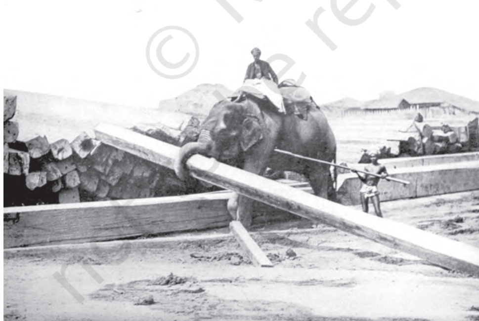
Fig.5 – Elephants piling squares of timber at a timber yard in Rangoon. In the colonial period elephants were frequently used to lift heavy timber both in the forests and at the timber yards.