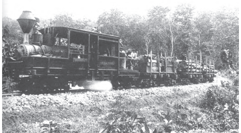
Fig.21 – Train transporting teak out of the forest – late colonial period.

As in India, the need to manage forests for shipbuilding and railways led to the