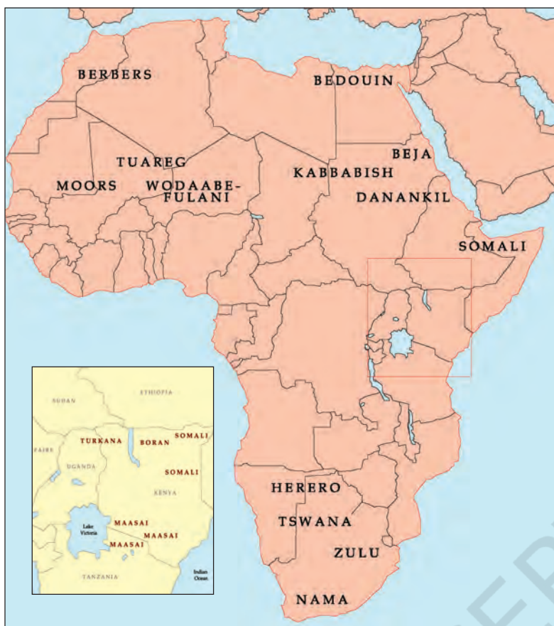
Fig. 13 – Pastoral communities in Africa. The inset shows the location of the Maasais in Kenya and Tanzania.

We will discuss some of these changes by looking at one pastoral community – the Maasai – in some detail. The Maasai cattle herders live primarily in east Africa: 300, 000 in southern Kenya and another 150,000 in Tanzania. We will see how new laws and regulations took away their land and restricted their movement. This affected their lives in times of drought and even reshaped their social relationships.