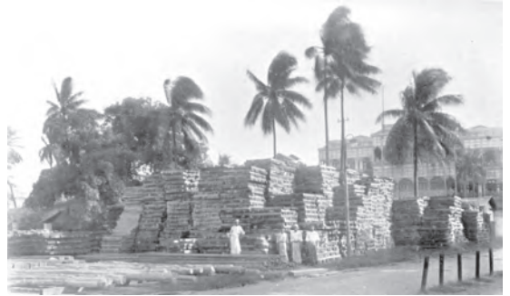
Fig.23 – Indian Munitions Board, War Timber Sleepers piled at Soolay pagoda ready for shipment, 1917.

Since the 1980s, governments across Asia and Africa have begun to see that scientific forestry and the policy of keeping forest communities away from forests has resulted in many conflicts. Conservation of forests rather than collecting timber has become a more important goal. The government has recognised that in order to meet this goal, the people who live near the forests must be involved. In many cases, across India, from Mizoram to Kerala, dense forests have survived only because villages protected them in sacred groves known as sarnas , devarakudn , kan , rai , etc. Some villages have been patrolling their own forests, with each household taking it in turns, instead of leaving it to the forest guards. Local forest communities and environmentalists today are thinking of different forms of forest management.