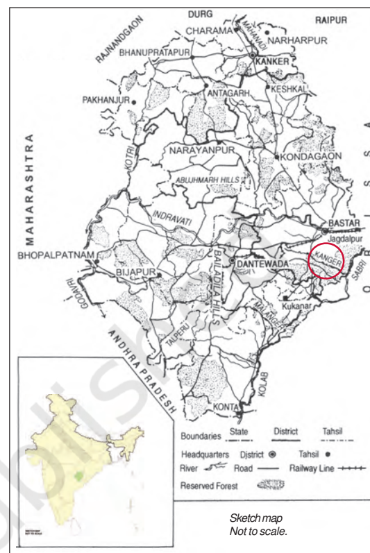
Fig.20 – Bastar in 2000.

This photograph of an army camp was taken in Bastar in 1910. The army moved with tents, cooks and soldiers. Here a sepoy is guarding the camp against rebels.