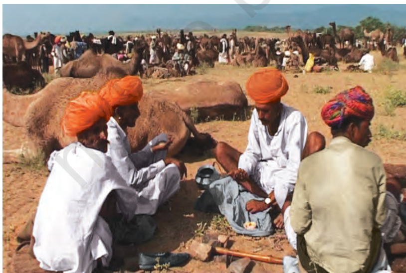
Fig. 8 – A camel fair at Pushkar.

How did the life of pastoralists change under colonial rule?