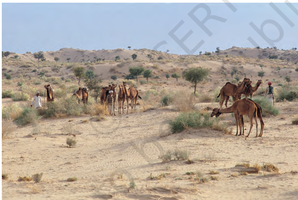
Fig.5 – Raika camels grazing on the Thar desert in western Rajasthan.

Dhangars were an important pastoral community of Maharashtra. In the early twentieth century their population in this region was estimated to be 467,000. Most of them were shepherds, some were blanket weavers, and still others were buffalo herders. The Dhangar shepherds stayed in the central plateau of Maharashtra during the monsoon. This was a semi-arid region with low rainfall and poor soil. It was covered with thorny scrub. Nothing but dry crops like bajra could be sown here. In the monsoon this tract became a vast grazing ground for the Dhangar flocks. By October the Dhangars harvested their bajra and started on their move west. After a march of about a month they reached the Konkan. This was a flourishing agricultural tract with high rainfall and rich soil. Here the shepherds