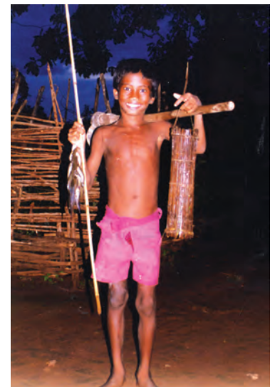
Fig. 17 – The little fisherman.

While the forest laws deprived people of their customary rights to hunt, hunting of big game became a sport. In India, hunting of tigers and other animals had been part of the culture of the court and nobility for centuries. Many Mughal paintings show princes and emperors enjoying a hunt. But under colonial rule the scale of hunting increased to such an extent that various species became almost extinct. The British saw large animals as signs of a wild, primitive and savage society. They believed that by killing dangerous animals the British