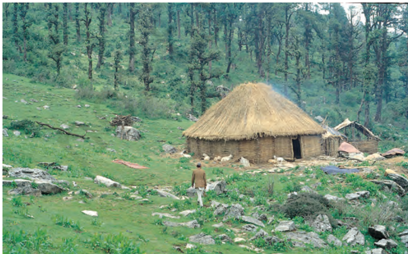
Fig.2 – A Gujjar Mandap on the high mountains in central Garhwal.

From: G.C. Barnes, Settlement Report of Kangra, 1850-55 .