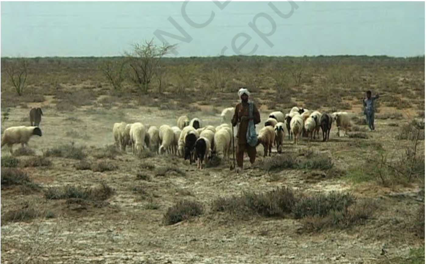
Fig.10 – Maldhari herders moving in search of pastures. Their villages are in the Rann of Kutch.

The genealogist recounts the history of the community. Such oral traditions give pastoral groups their own sense of identity. These oral traditions can tell us about how a group looks at its own past.