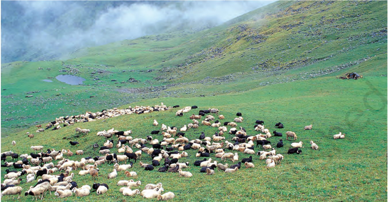
Fig. 1 – Sheep grazing on the Bugyals of eastern Garhwal.

Bugyals are vast natural pastures on the high mountains, above 12,000 feet. They are under snow in the winter and come to life after April. At this time the entire mountainside is covered with a variety of grasses, roots and herbs. By monsoon, these pastures are thick with vegetation and carpeted with wild flowers.