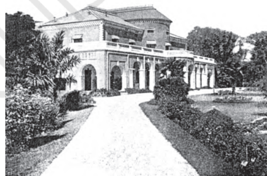
Fig. 11 – The Imperial Forest School, Dehra Dun, India. The first forestry school to be inaugurated in the British Empire.

Foresters and villagers had very different ideas of what a good forest should look like. Villagers wanted forests with a mixture of species to satisfy different needs – fuel, fodder, leaves. The forest department on the other hand wanted trees which were suitable for building