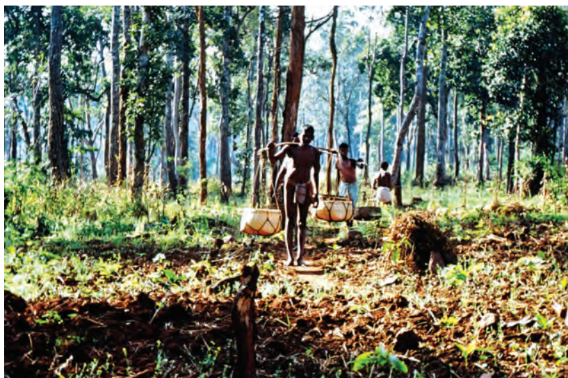
Fig. 14 – Bringing grain from the threshing grounds to the field.

The men are carrying grain in baskets from the threshing fields. Men carry the baskets slung on a pole across their shoulders, while women carry the baskets on their heads.