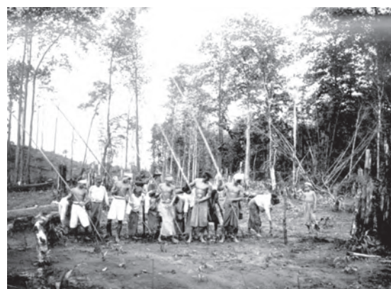
Fig. 15 – Taungya cultivation was a system in which local farmers were allowed to cultivate temporarily within a plantation. In this photo taken in Tharrawaddy division in Burma in 1921 the cultivators are sowing paddy. The men make holes in the soil using long bamboo poles with iron tips. The women sow paddy in each hole.

Children living around forest areas can often identify hundreds of species of trees and plants. How many species of trees can you name?