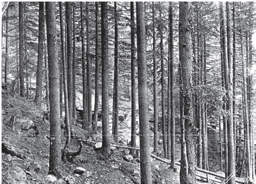
Fig. 10 – A deodar plantation in Kangra, 1933. From Indian Forest Records , Vol. XV.

punished. So Brandis set up the Indian Forest Service in 1864 and helped formulate the Indian Forest Act of 1865. The Imperial Forest Research Institute was set up at Dehradun in 1906. The system they taught here was called ‘ scientific forestry ’. Many people now, including ecologists, feel that this system is not scientific at all.