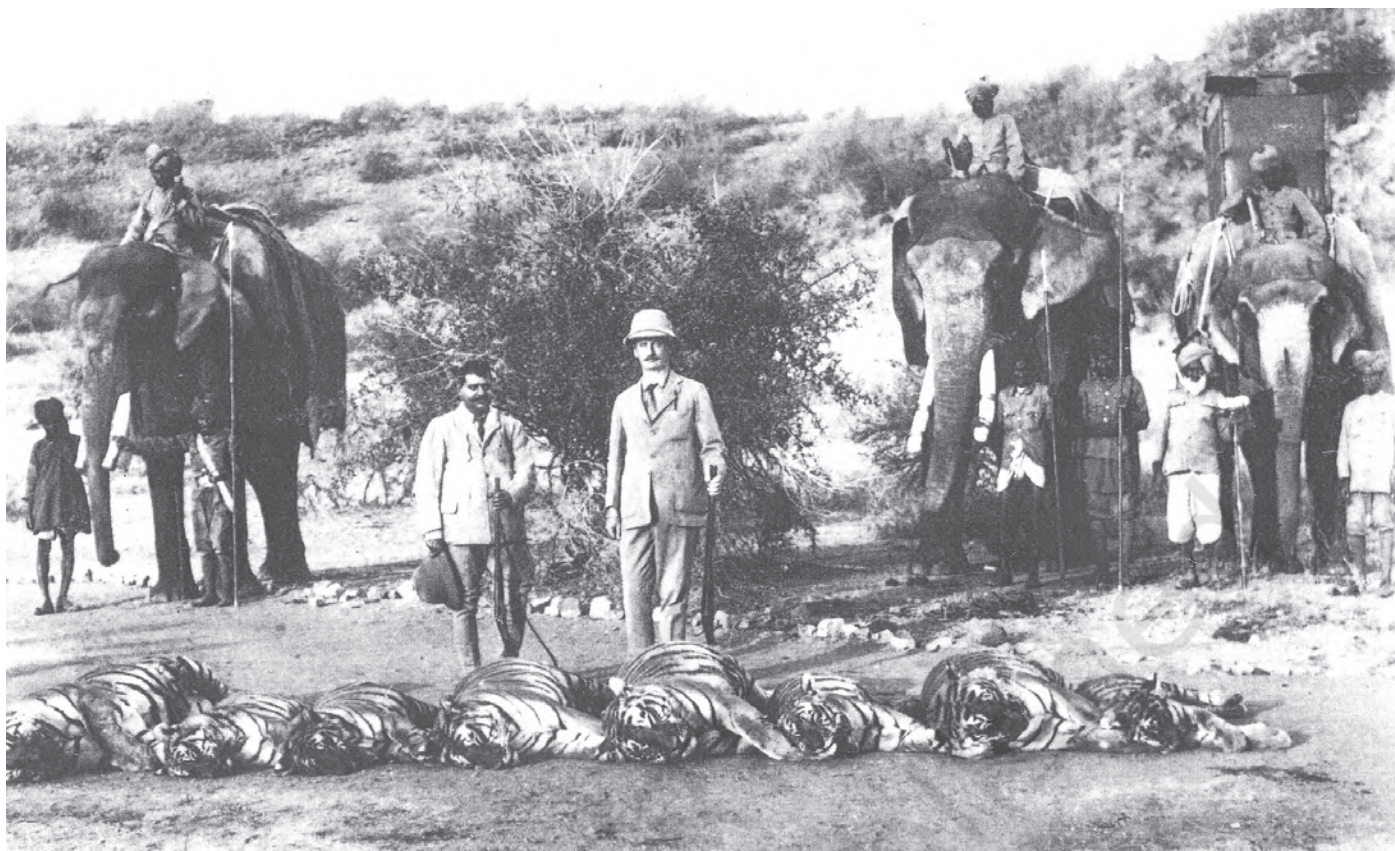
Fig. 18 – Lord Reading hunting in Nepal.

Count the dead tigers in the photo. When British colonial officials and Rajas went hunting they were accompanied by a whole retinue of servants. Usually, the tracking was done by skilled village hunters, and the Sahib simply fired the shot.