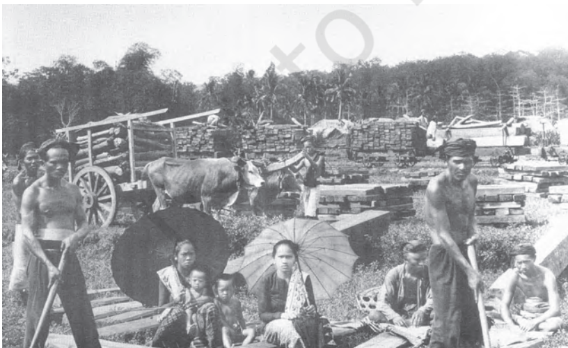
Fig.24 – Log yard in Rembang under Dutch colonial rule.

The Allies would not have been as successful in the First World War and the Second World War if they had not been able to exploit the resources and people of their colonies. Both the world wars had a devastating effect on the forests of India, Indonesia and elsewhere. The forest department cut freely to satisfy war needs.