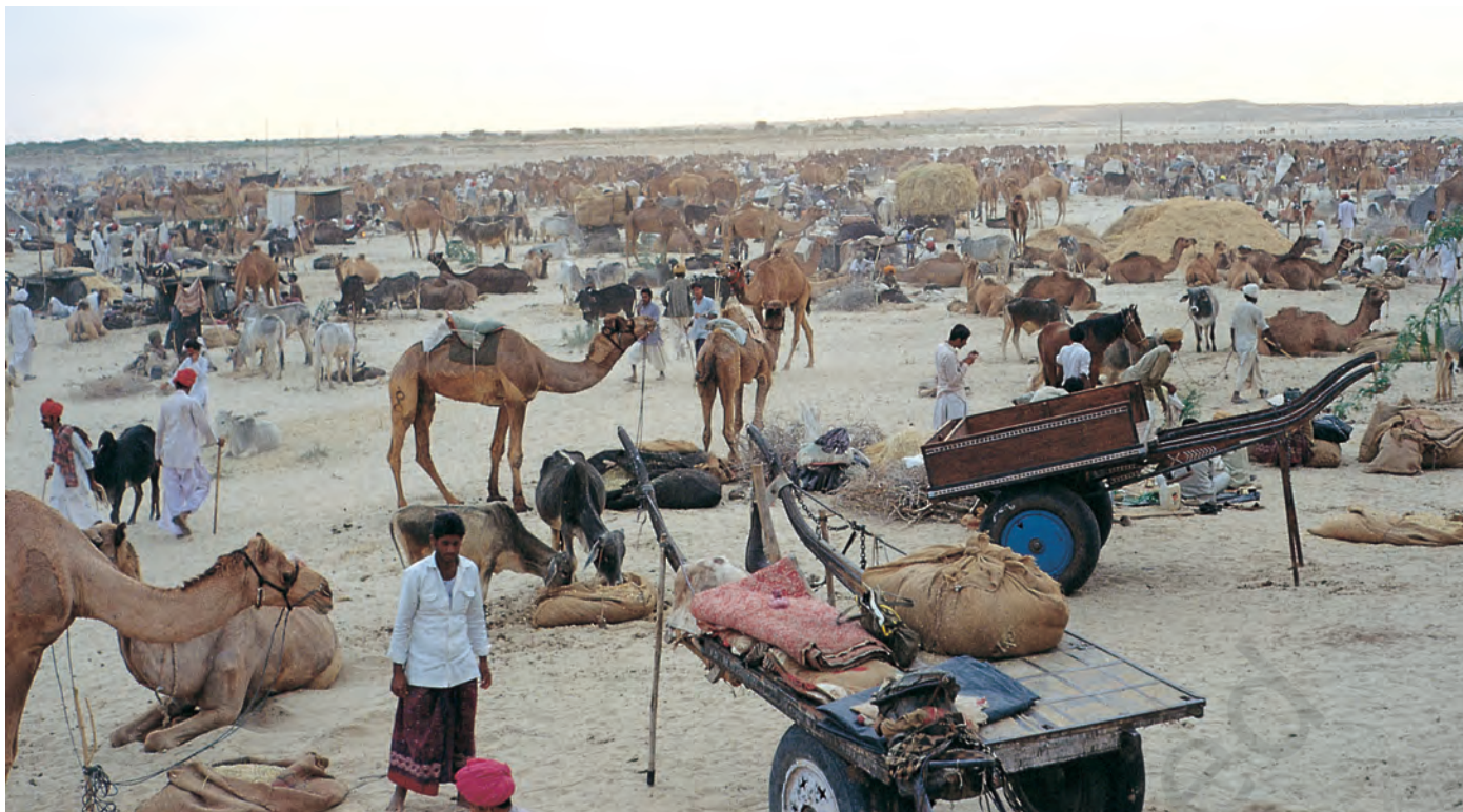
Fig. 7 – A camel fair at Balotra in western Rajasthan. Camel herders come to the fair to sell and buy camels. The Maru Raikas also display their expertise in training their camels. Horses from Gujarat are also brought for sale at this fair.

So we see that the life of these pastoral groups was sustained by a careful consideration of a host of factors. They had to judge how long the herds could stay in one area, and know where they could find water and pasture. They needed to calculate the timing of their movements, and ensure that they could move through different territories. They had to set up a relationship with farmers on the way, so that the herds could graze in harvested fields and manure the soil. They combined a range of different activities – cultivation, trade, and herding – to make their living.