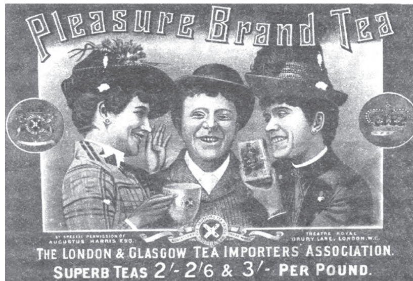
Fig.8 – Pleasure Brand Tea.

Large areas of natural forests were also cleared to make way for tea, coffee and rubber plantations to meet Europe's growing need for these commodities. The colonial government took over the forests, and gave vast areas to European planters at cheap rates. These areas were enclosed and cleared of forests, and planted with tea or coffee.