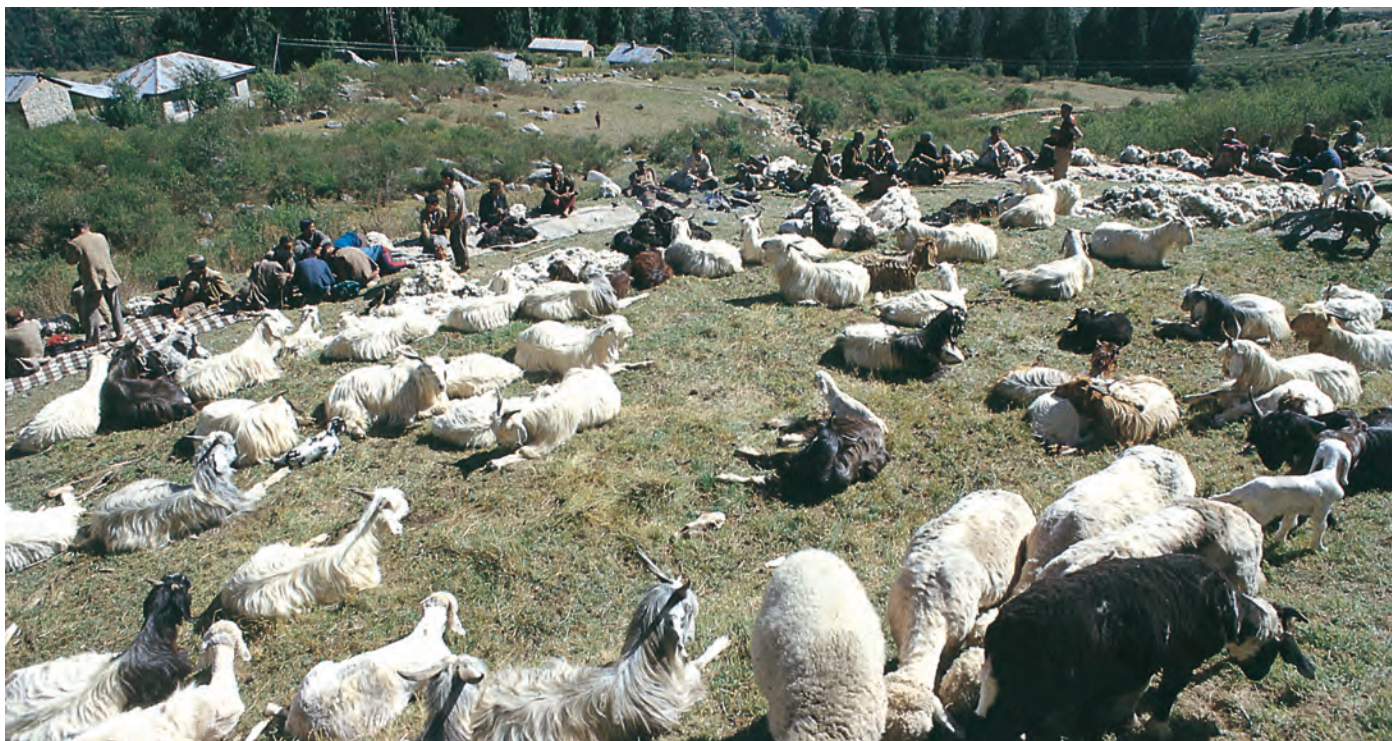
Fig.3 – Gaddis waiting for shearing to begin. Uhl valley near Palampur in Himachal Pradesh.

meadows. By September they began their return movement. On the way they stopped once again in the villages of Lahul and Spiti, reaping their summer harvest and sowing their winter crop. Then they descended with their flock to their winter grazing ground on the Siwalik hills. Next April, once again, they began their march with their goats and sheep, to the summer meadows.