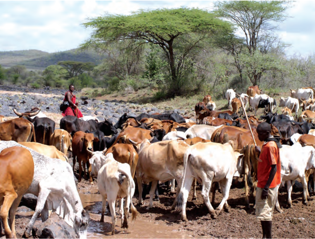
Fig.15 – The title Maasai derives from the word Maa. Maa-sai means 'My People'. The Maasai are traditionally nomadic and pastoral people who depend on milk and meat for subsistence. High temperatures combine with low rainfall to create conditions which are dry, dusty, and extremely hot. Drought conditions are common in this semi-arid land of equatorial heat. During such times pastoral animals die in large numbers.