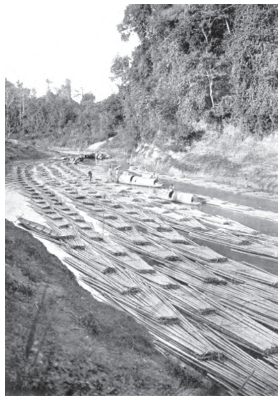
Fig.4 – Bamboo rafts being floated down the Kassalong river, Chittagong Hill Tracts.

From the 1860s, the railway network expanded rapidly. By 1890, about 25,500 km of track had been laid. In 1946, the length of the tracks had increased to over 765,000 km. As the railway tracks spread through India, a larger and larger number of trees were felled. As early as the 1850s, in the Madras Presidency alone, 35,000 trees were being cut annually for sleepers. The government gave out contracts to individuals to supply the required quantities. These contractors began cutting trees indiscriminately. Forests around the railway tracks fast started disappearing.