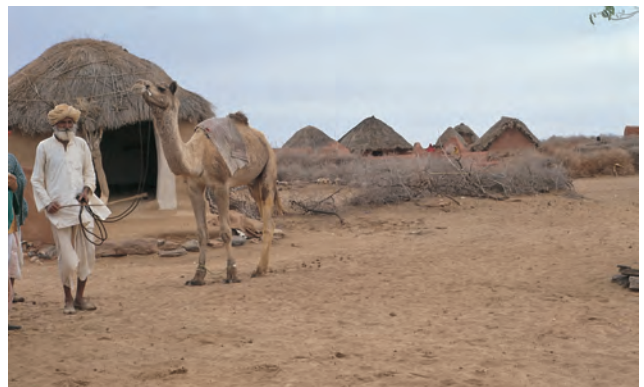
Fig. 6 – A camel herder in his settlement. This is on the Thar desert near Jaisalmer in Rajasthan. The camel herders of the region are Maru (desert) Raikas, and their settlement is called a dhandi.