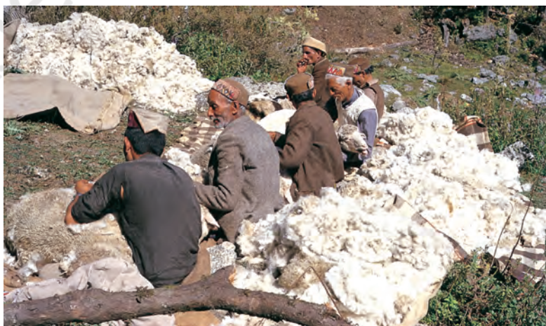
Fig.4 – Gaddi sheep being sheared.

Bugyal – Vast meadows in the high mountains