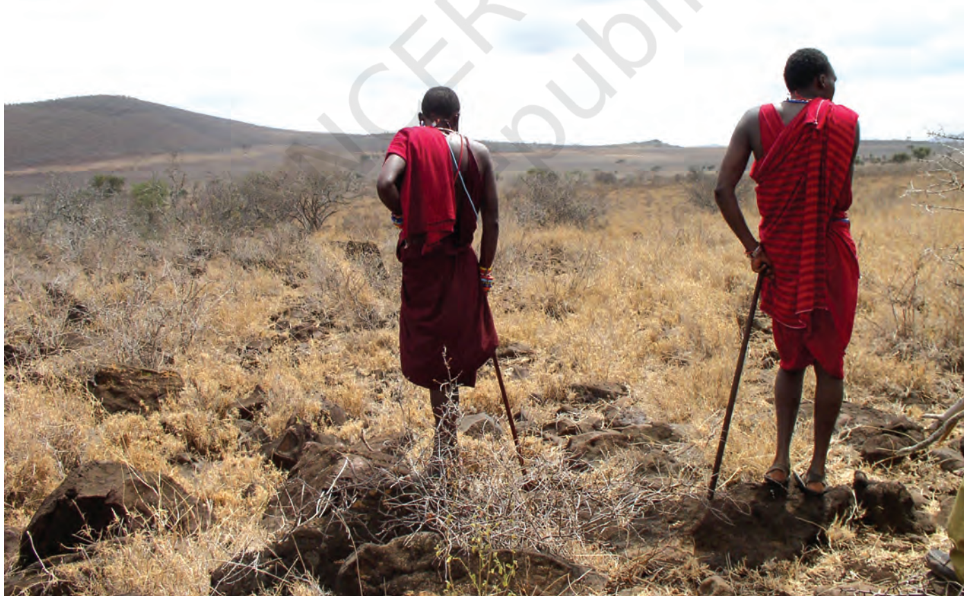
Fig. 14 – Without grass, livestock (cattle, goats and sheep) are malnourished, which means less food available for families and their children. The areas hardest hit by drought and food shortage are in the vicinity of Amboseli National Park, which last year generated approximately 240 million Kenyan Shillings (estimated $3.5 million US) from tourism. In addition, the Kilimanjaro Water Project cuts through the communities of this area but the villagers are barred from using the water for irrigation or for livestock.

Large areas of grazing land were also turned into game reserves like the Maasai Mara and Samburu National Park in Kenya and Serengeti Park in Tanzania. Pastoralists were not allowed to enter these reserves; they could neither hunt animals nor graze their herds in these areas. Very often these reserves were in areas that had traditionally been regular grazing grounds for Maasai herds. The Serengeti National Park, for instance, was created over 14,760 km. of Maasai grazing land.