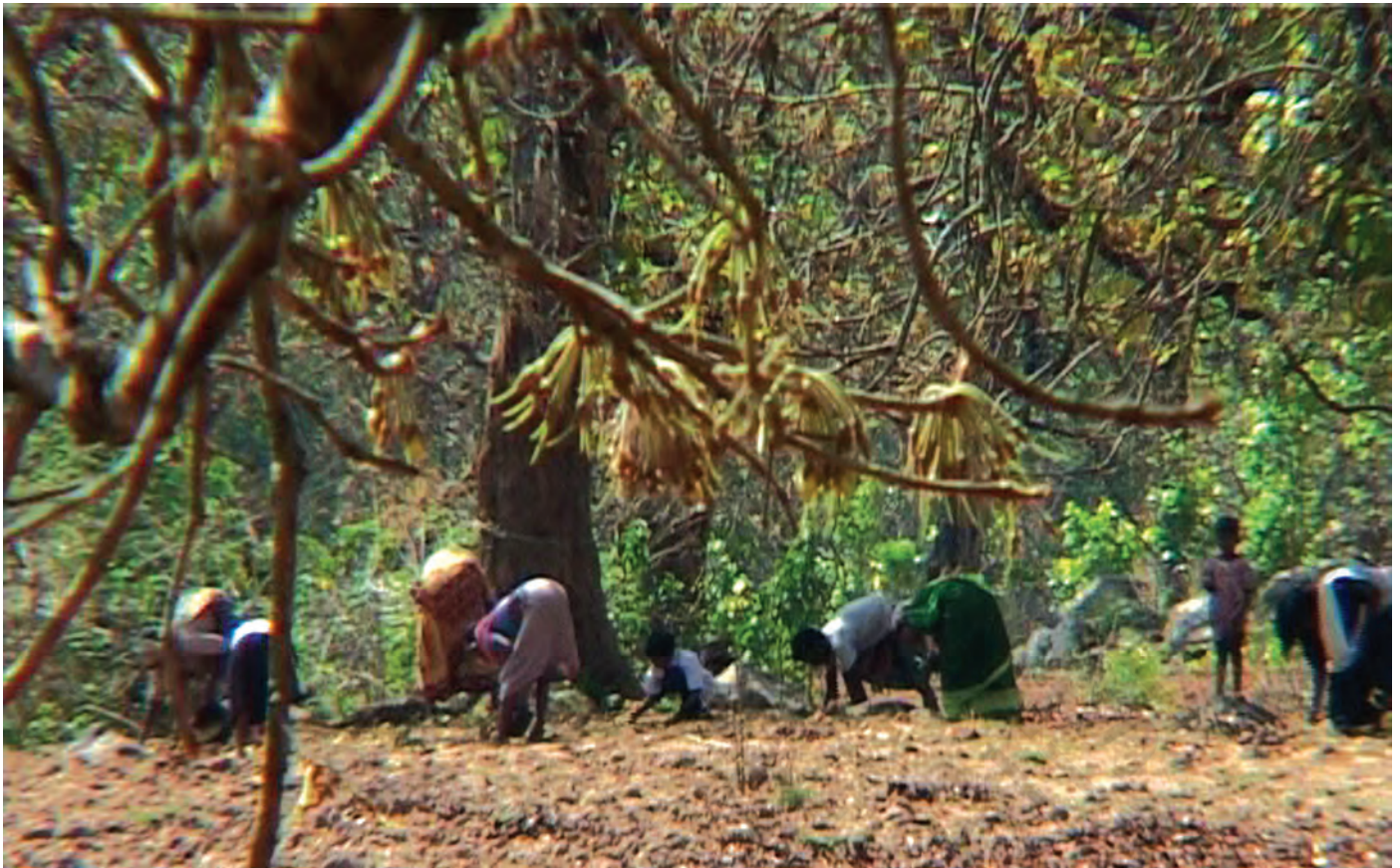
Fig. 12 – Collecting mahua ( Madhuca indica ) from the forests.

Villagers wake up before dawn and go to the forest to collect the mahua flowers which have fallen on the forest floor. Mahua trees are precious. Mahua flowers can be eaten or used to make alcohol. The seeds can be used to make oil.