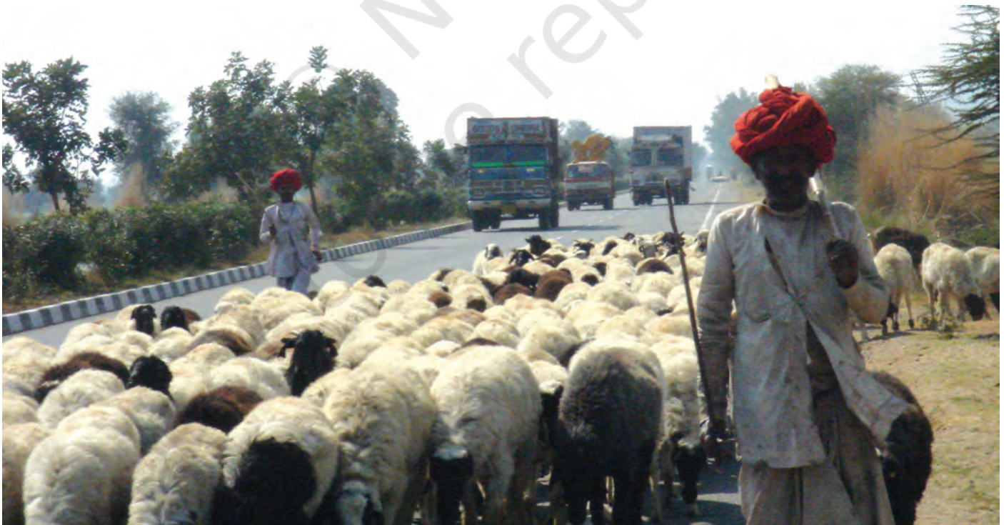
Fig. 18 – A Raika shepherd on Jaipur highway. Heavy traffic on highways has made migration of shepherds a new experience.

Yet, pastoralists do adapt to new times. They change the paths of their annual movement, reduce their cattle numbers, press for rights to enter new areas, exert political pressure on the government for relief, subsidy and other forms of support and demand a right in the management of forests and water resources. Pastoralists are not relics of the past. They are not people who have no place in the modern world. Environmentalists and economists have increasingly come to recognise that pastoral nomadism is a form of life that is perfectly suited to many hilly and dry regions of the world.