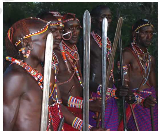
Fig. 16 – Note how the warriors wear traditional deep red shukas, brightly beaded Maasai jewelry and carry five-foot, steel tipped spears. Their long pleats of intricately plaited hair are tinted red with ochre. As per tradition they face East to honour the rising sun. Warriors are in charge of society's security while boys are responsible for herding livestock. During the drought season, both warriors and boys assume responsibility for herding livestock.

In Maasailand, as elsewhere in Africa, not all pastoralists were equally affected by the changes in the colonial period. In pre-colonial times Maasai society was divided into two social categories – elders and warriors. The elders formed the ruling group and met in periodic councils to decide on the affairs of the community and settle disputes. The warriors consisted of younger people, mainly responsible for the protection of the tribe. They defended the community and organised cattle raids. Raiding was important in a society where cattle was wealth. It is through raids that the power of different pastoral groups was asserted. Young men came to be recognised as members of the warrior class when they proved their manliness by raiding the cattle of other pastoral groups and participating in wars. They, however, were subject to the authority of the elders.