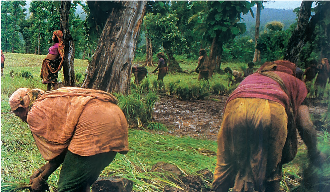
Fig. 6 – Bhil women cultivating in a forest in Gujarat

Shifting cultivation continues in many forest areas of Gujarat. You can see that trees have been cut and land cleared to create patches for cultivation.