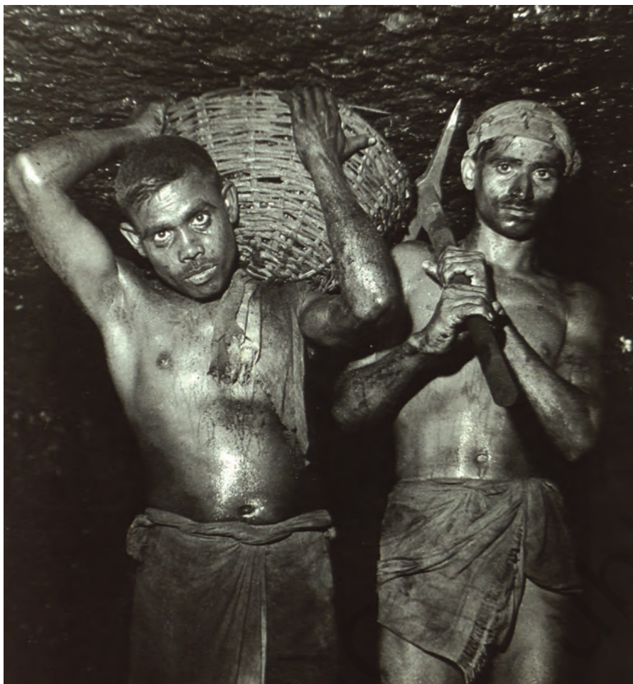
Fig. 10 – Coal miners of Bihar, 1948

In the 1920s about 50 per cent of the miners in the Jharia and Raniganj coal mines of Bihar were tribals. Work deep down in the dark and suffocating mines was not only back-breaking and dangerous, it was often literally killing. In the 1920s over 2,000 workers died every year in the coal mines in India.