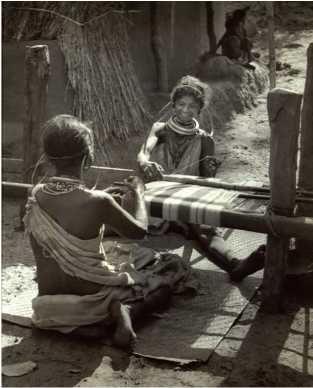
Fig. 8 – Godara women weaving

Many tribal groups reacted against the colonial forest laws. They disobeyed the new rules, continued with practices that were declared illegal, and at times rose in open rebellion. Such was the revolt of Songram Sangma in 1906 in Assam, and the forest satyagraha of the 1930s in the Central Provinces.