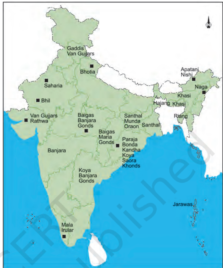
Fig. 3 – Location of some tribal groups in India

Many tribal groups lived by herding and rearing animals. They were pastoralists who moved with their herds of cattle or sheep according to the seasons. When the grass in one place was exhausted, they moved to another area. The Van Gujjars of the Punjab hills and the Labadis of Andhra Pradesh were cattle herders, the Gaddis of Kulu were shepherds, and the Bakarwals of Kashmir reared goats. You will read more about them in your history book next year.