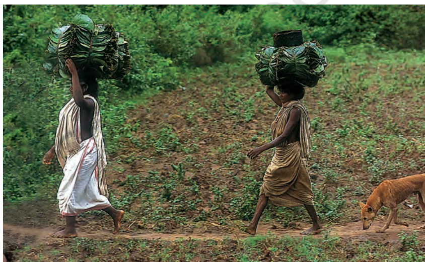
Fig. 2 – Dongria Kandha women in Orissa take home pandanus leaves from the forest to make plates

Mahua – A flower that is eaten or used to make alcohol