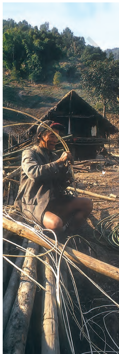
Fig. 5 – A log house being built in a village of the Nyishi tribes of Arunachal Pradesh.

Bewar – A term used in Madhya Pradesh for shifting cultivation