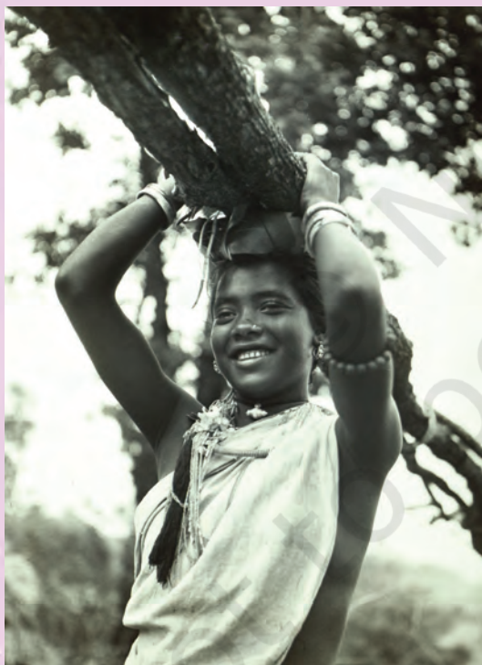
Fig. 4 – A Santhal girl carrying firewood, Bihar, 1946

Adapted from Verrier Elwin, Baiga (1939) and Elwin's unpublished 'Notes on the Khonds' (Verrier Elwin Papers, Nehru Memorial Museum and Library)