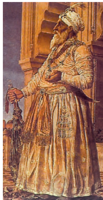
Fig. 3 Burhan-ul-Mulk Sa'adat Khan.

The state depended on local bankers and mahajans for loans. It sold the right to collect tax to the highest bidders. These "revenue farmers" ( ijaradars ) agreed to pay the state a fixed sum of money. Local bankers guaranteed the payment of this contracted amount to the state. In turn, the revenue-farmers were given considerable freedom in the assessment and collection of taxes. These developments allowed new social groups, like moneylenders and bankers, to influence