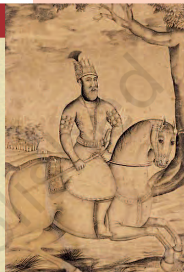
Fig. 1 A 1779 portrait of Nadir Shah.