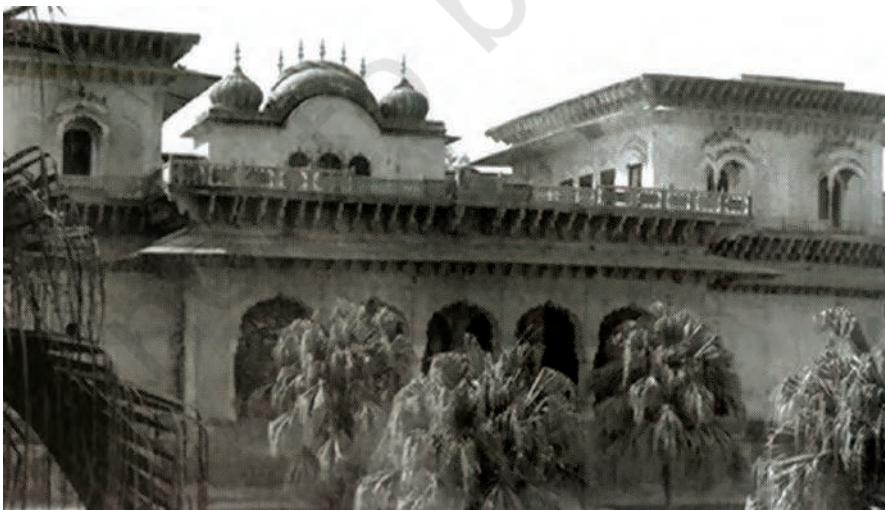
Fig. 8 Eighteenth-century palace complex at Dig. Note the “Bangla dome” on the assembly hall on the roof of the building.

The power of the Jats reached its zenith under Suraj Mal who consolidated the Jat state at Bharatpur (in present day Rajasthan) during 1756-1763. The areas under the political control of Suraj Mal broadly included parts of modern eastern Rajasthan, southern Haryana, western Uttar Pradesh and Delhi. Suraj Mal built a number of forts and palaces and the famous Lohagarh fort in Bharatpur is regarded as one of the strongest forts built in this region.