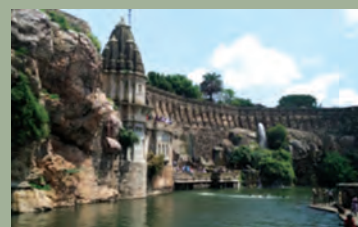
Fig. 4b. Chittorgarh Fort, Rajasthan

Many Rajput chieftains built a number of forts on hill tops which became centres of power. With extensive fortifications, these majestic structures housed urban centres, palaces, temples, trading centres, water harvesting structures and other buildings. The Chittorgarh fort contained many water bodies varying from talabs (ponds) to kundis (wells), baolis (stepwells), etc.