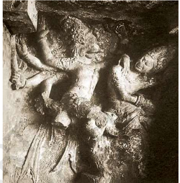
Fig. 1 Wall relief from Cave 15, Ellora, showing Vishnu as Narasimha, the man-lion. It is a work of the Rashtrakuta period.

Many of these new kings adopted high-sounding titles such as maharaja-adhiraja (great king, overlord of kings), tribhuvana-chakravartin (lord of the three worlds) and so on. However, in spite of such claims,