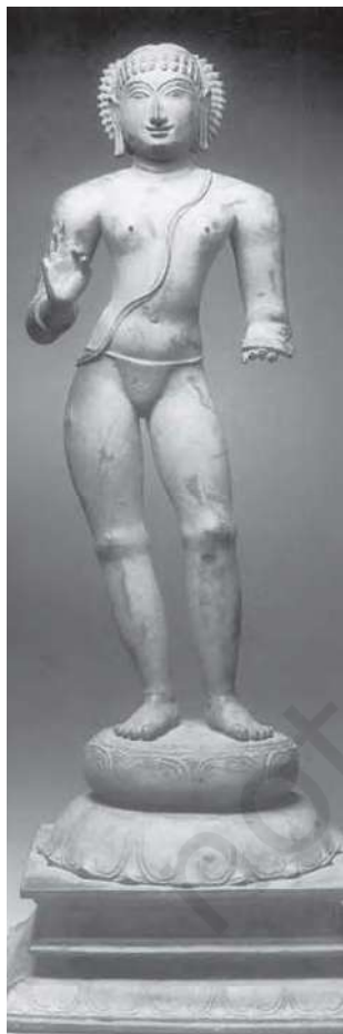
Fig. 2 A bronze image of Manikkavasagar.