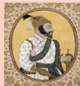
Fig. 7a Portrait of Shivaji

The Maratha kingdom was another powerful regional kingdom to arise out of a sustained opposition to Mughal rule. Shivaji (1627-1680) carved out a stable kingdom with the support of powerful warrior families ( deshmukhs ). Groups of highly mobile, peasant-pastoralists ( kunbis ) provided the backbone of the Maratha army. Shivaji used these forces to challenge the Mughals in the peninsula. After Shivaji's death, effective power in the Maratha state was wielded by a family of Chitpavan Brahmanas who served Shivaji's successors as Peshwa (or principal minister). Poona became the capital of the Maratha kingdom.