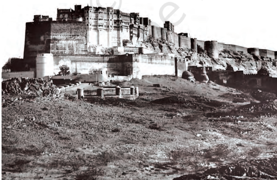
Fig. 5 Mehrangarh Fort, Jodhpur

Raja Jai Singh was at the height of his power. He was the governor of Agra for 12 years and of Malwa for 5 or 6 years. He possessed a large army, artillery and great wealth. His sway extended from Delhi to the banks of the Narmada.