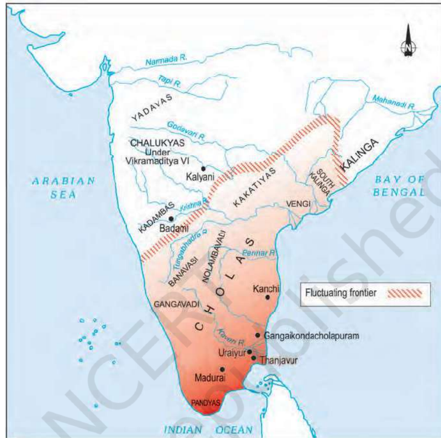
Map 2 The Chola kingdom and its neighbours.