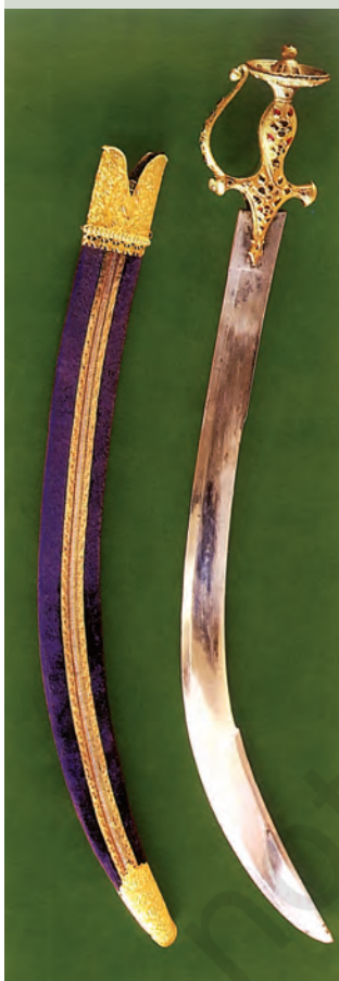
Fig. 7 Sword of Maharaja Ranjit Singh.

What is the Khalsa ? Do you recall reading about it in Chapter 8?