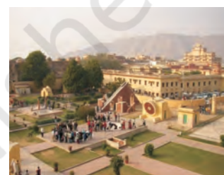
Fig. 4c Jantar Mantar in Jaipur

Sawai Jai Singh, the ruler of Amber constructed five astronomical observatories, one each in Delhi, Jaipur, Ujjain, Mathura and Varanasi. Commonly known as Jantar Mantar, these observatories had various instruments to study heavenly bodies.