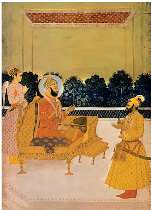
Fig. 2 Farrukh Siyar receiving a noble in court.

possible humiliation came when two Mughal emperors, Farrukh Siyar (1713-1719) and Alamgir II (1754-1759) were assassinated, and two others Ahmad Shah (1748-1754) and Shah Alam II (1759-1816) were blinded by their nobles.