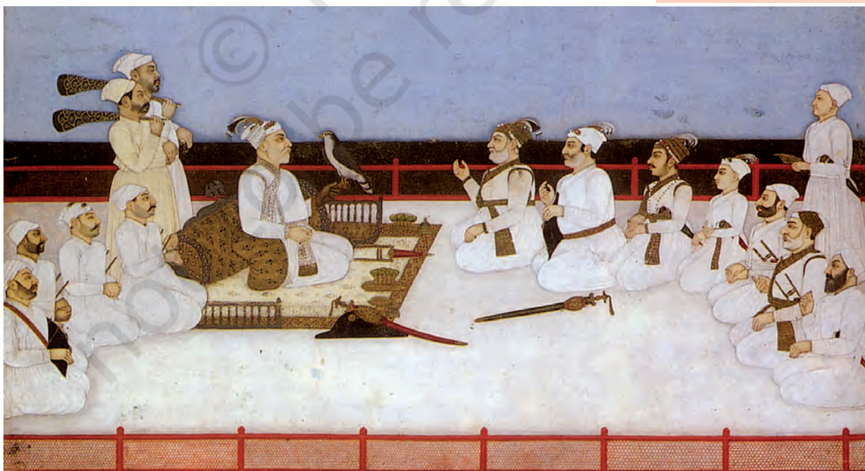
Fig. 4 Alivardi Khan holding court.

The formation of a regional state in eighteenth-century Bengal therefore led to considerable change amongst the zamindars. The close connection between the state and bankers – noticeable in