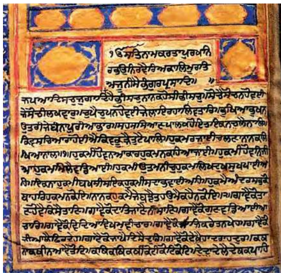
Fig. 11 An early manuscript of the Guru Granth Sahib.

a new script known as Gurmukhi. The three successors of Guru Angad also wrote under the name of “Nanak” and all of their compositions were compiled by Guru Arjan in 1604. To this compilation were added the writings of other figures like Shaikh Farid, Sant Kabir, Bhagat Namdev and Guru Tegh Bahadur. In 1706 this compilation was authenticated by Guru Tegh Bahadur’s son and successor, Guru Gobind Singh. It is now known as Guru Granth Sahib , the holy scripture of the Sikhs.