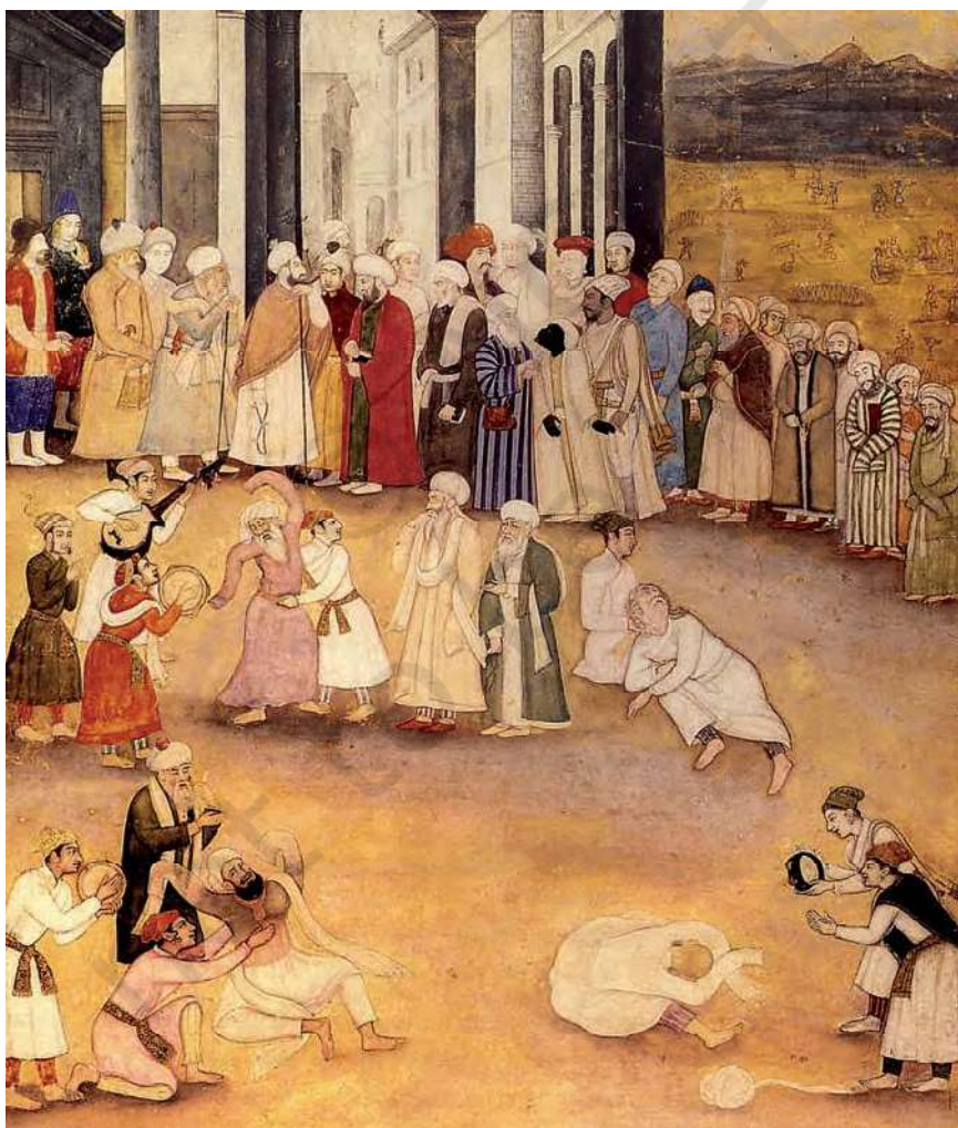
Fig. 4 Mystics in ecstasy.

disregard for the world. Like the saint-poets, the Sufis too composed poems expressing their feelings, and a rich literature in prose, including anecdotes and fables, developed around them. Among the great Sufis of Central Asia were Ghazzali, Rumi and Sadi. Like the Nathpanthis, Siddhas and Yogis, the Sufis too believed that the heart can be trained to look at the world in a different way. They developed elaborate methods of training using zikr (chanting of a name or sacred formula), contemplation, sama (singing), raqs (dancing), discussion of parables, breath control, etc. under the guidance of a master or pir . Thus emerged the silsilas , a spiritual genealogy of Sufi teachers, each following a slightly different method ( tariqa ) of instruction and ritual practice.